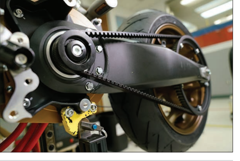
Fig. 3: Narrow, lightweight drives improve performance on an e-motorcycle.