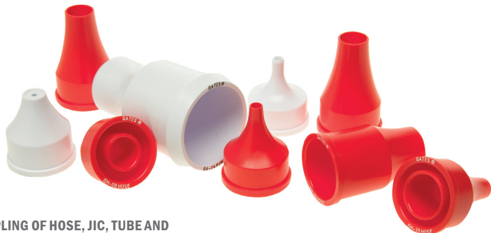
SAMPLING OF HOSE, JIC, TUBE AND FFORX NOZZLES