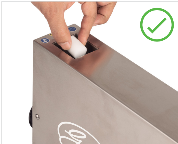
Correct Loading of the Projectile

Ultra Clean Projectiles should ONLY be dropped through the top opening on the Bench Mount Launcher in a horizontal fashion for optimal performance. The Projectile can only be dropped through top opening in this manner (as shown) due to the size of the projectile and the top opening of the launcher. Failure to do so will cause the projectiles to jam.