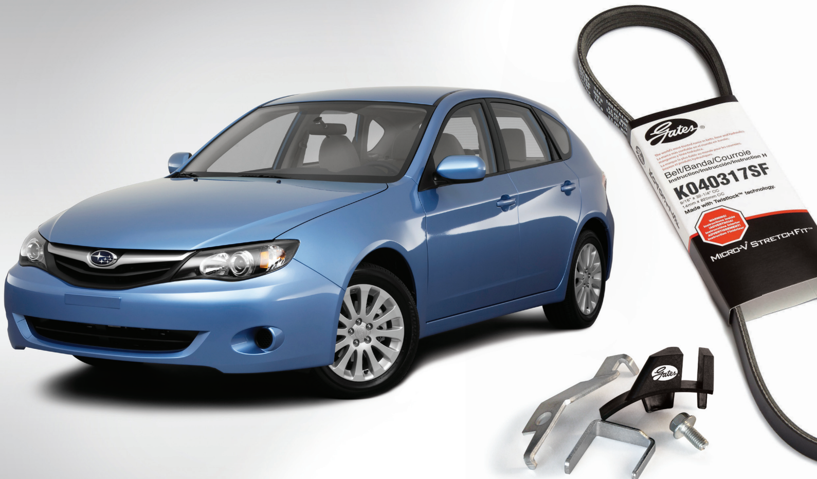
Installation Tool: Part - #91031